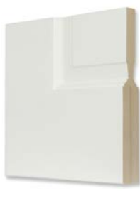
Profiles on fire-rated doors have true depth and definition, not plant-on mouldings