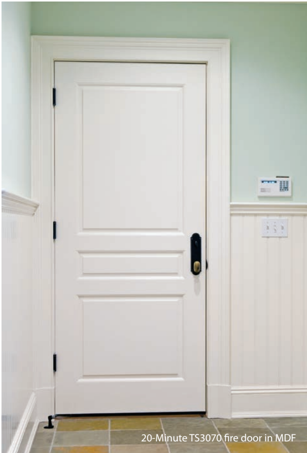
20-Minute TS3070 fire door in MDF

Throw away the preconception that you have limited design options for fire-rated openings. With hundreds of styles and unlimited custom capabilities, TruStile ensures you will never sacrifice style when selecting 20- through 90-minute fire doors.