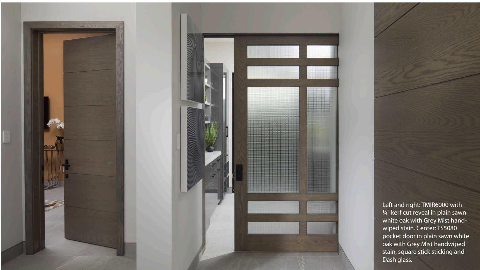
Left and right: TMIR6000 with ¼" kerf cut reveal in plain sawn white oak with Grey Mist handwiped stain. Center: TS5080 pocket door in plain sawn white oak with Grey Mist handwiped stain, square stick sticking and Dash glass.