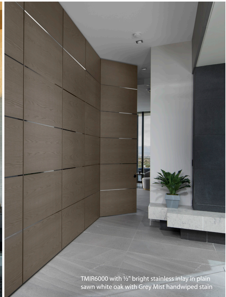
TMIR6000 with 1/2" bright stainless inlay in plain sawn white oak with Grey Mist handwiped stain