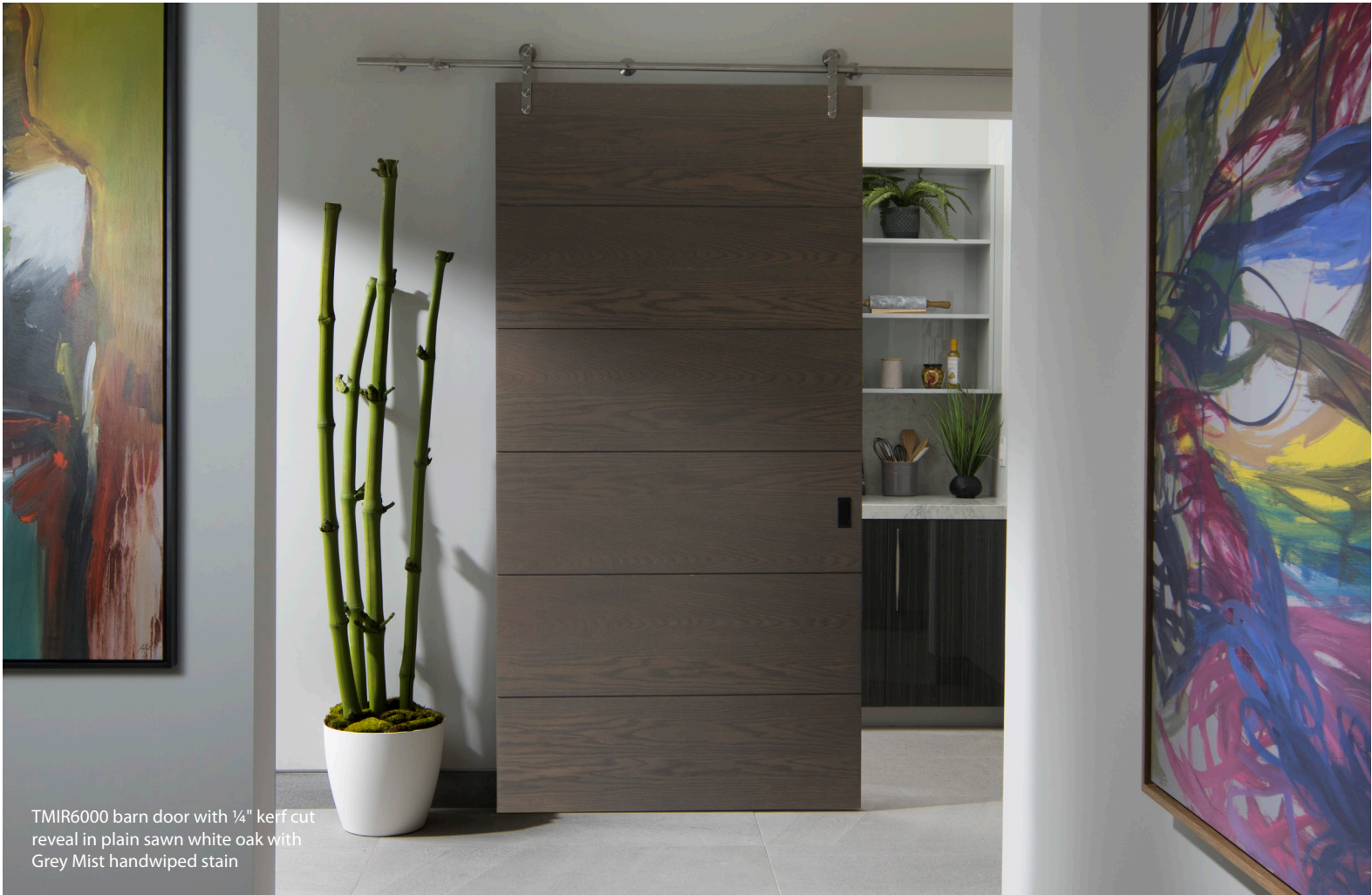
TMIR6000 barn door with 1/4" kerf cut reveal in plain sawn white oak with Grey Mist handwiped stain