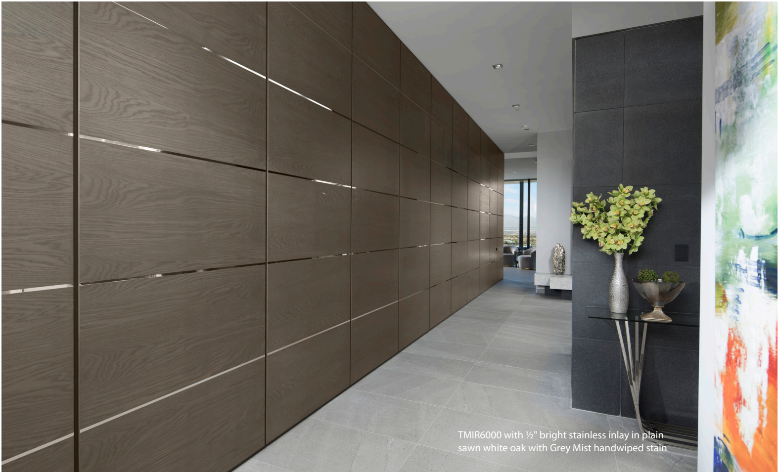
TMIR6000 with 1/2" bright stainless inlay in plain sawn white oak with Grey Mist handwiped stain