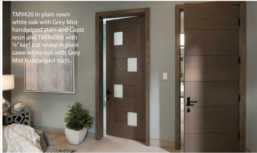
TM9420 in plain sawn white oak with Grey Mist handwiped stain and Capiz resin and TMIR6000 with ¼" kerf cut reveal in plain sawn white oak with Grey Mist handwiped stain.