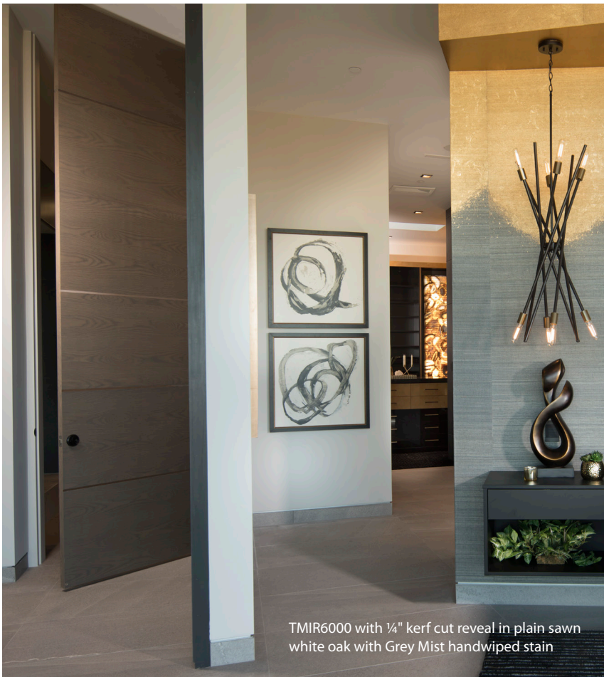
TMIR6000 with 1/4" kerf cut reveal in plain sawn white oak with Grey Mist handwiped stain