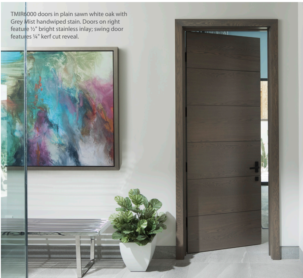
TMIR6000 doors in plain sawn white oak with Grey Mist handwiped stain. Doors on right feature ½" bright stainless inlay; swing door features ¼" kerf cut reveal.

At the opposite end of the hallway, TMIR6000 doors open to two guest bedrooms. These doors use ¼" kerf cut reveals instead of steel inlays, complementing the hallway doors while defining their own unique space.