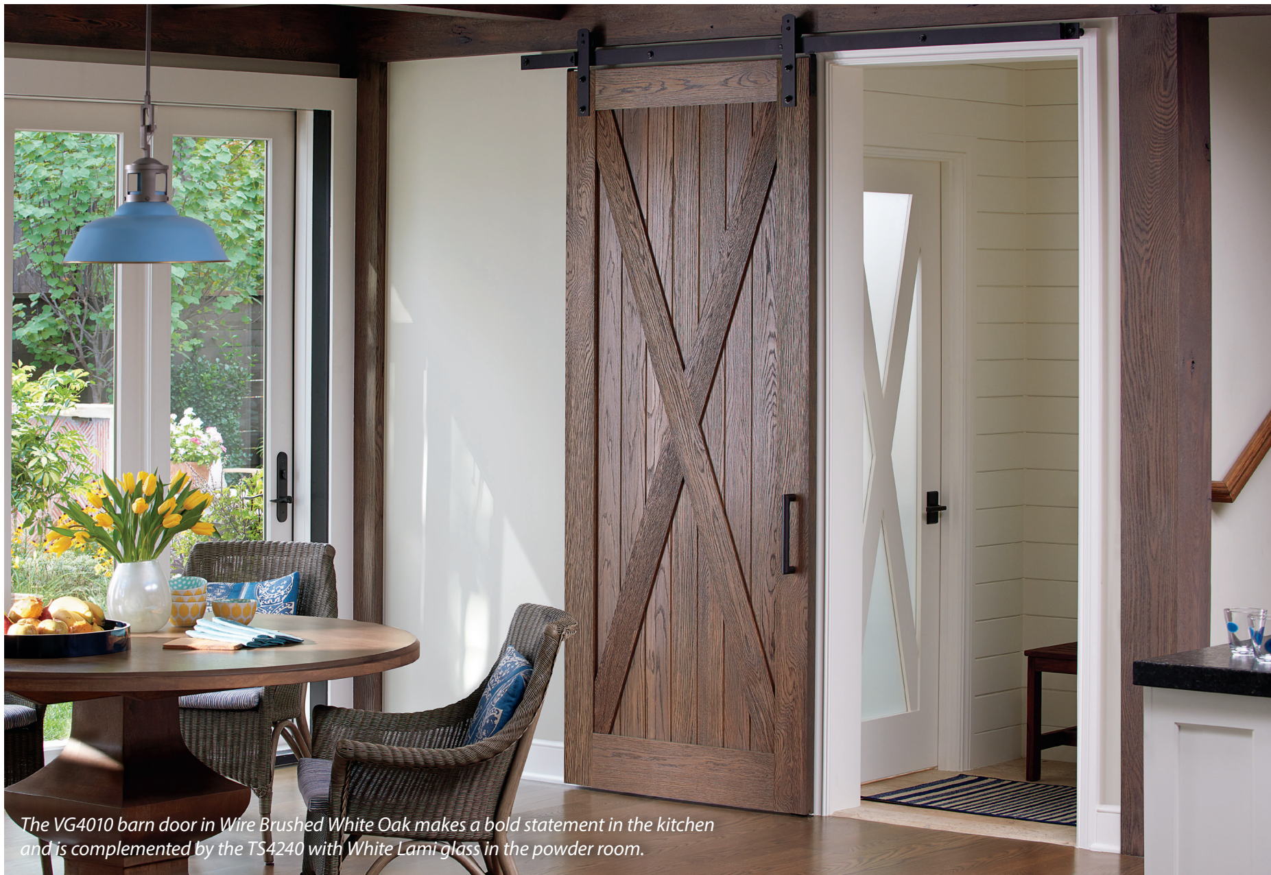
The VG4010 barn door in Wire Brushed White Oak makes a bold statement in the kitchen and is complemented by the TS4240 with White Lami glass in the powder room.