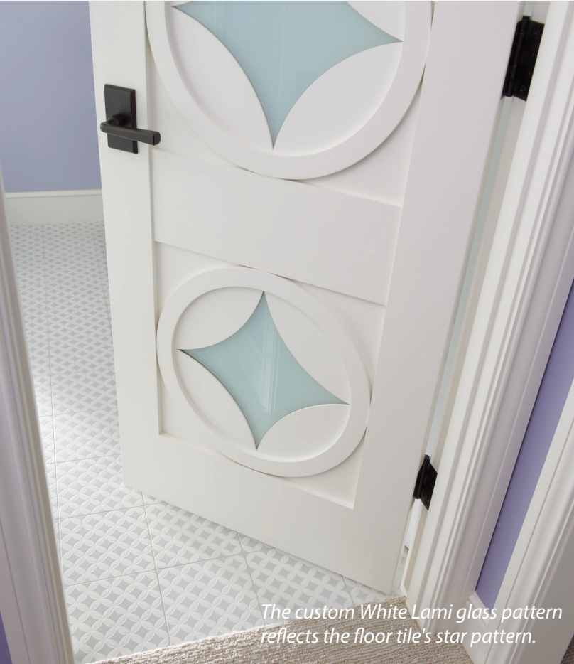
The custom White Lami glass pattern reflects the floor tile's star pattern.