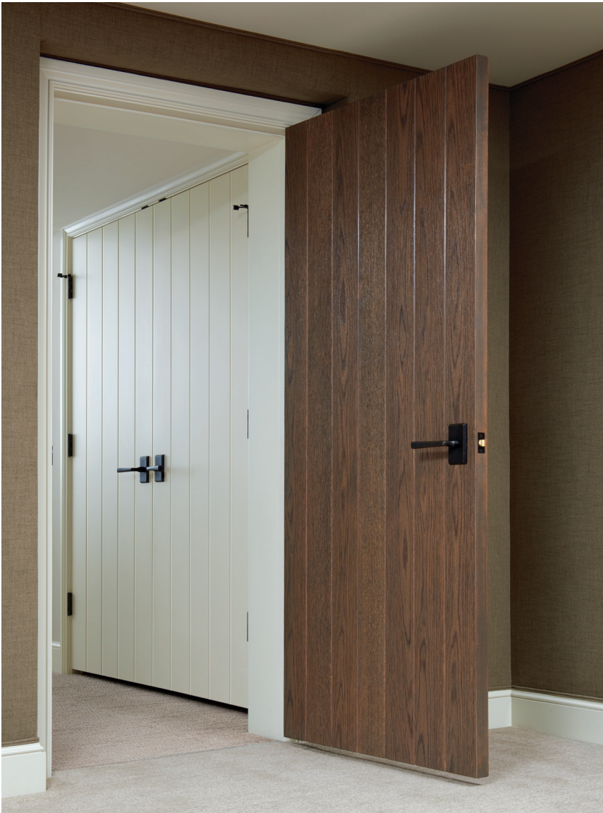
The home seamlessly mixes paint-grade MDF and stain-grade hardwoods in the same profile design.