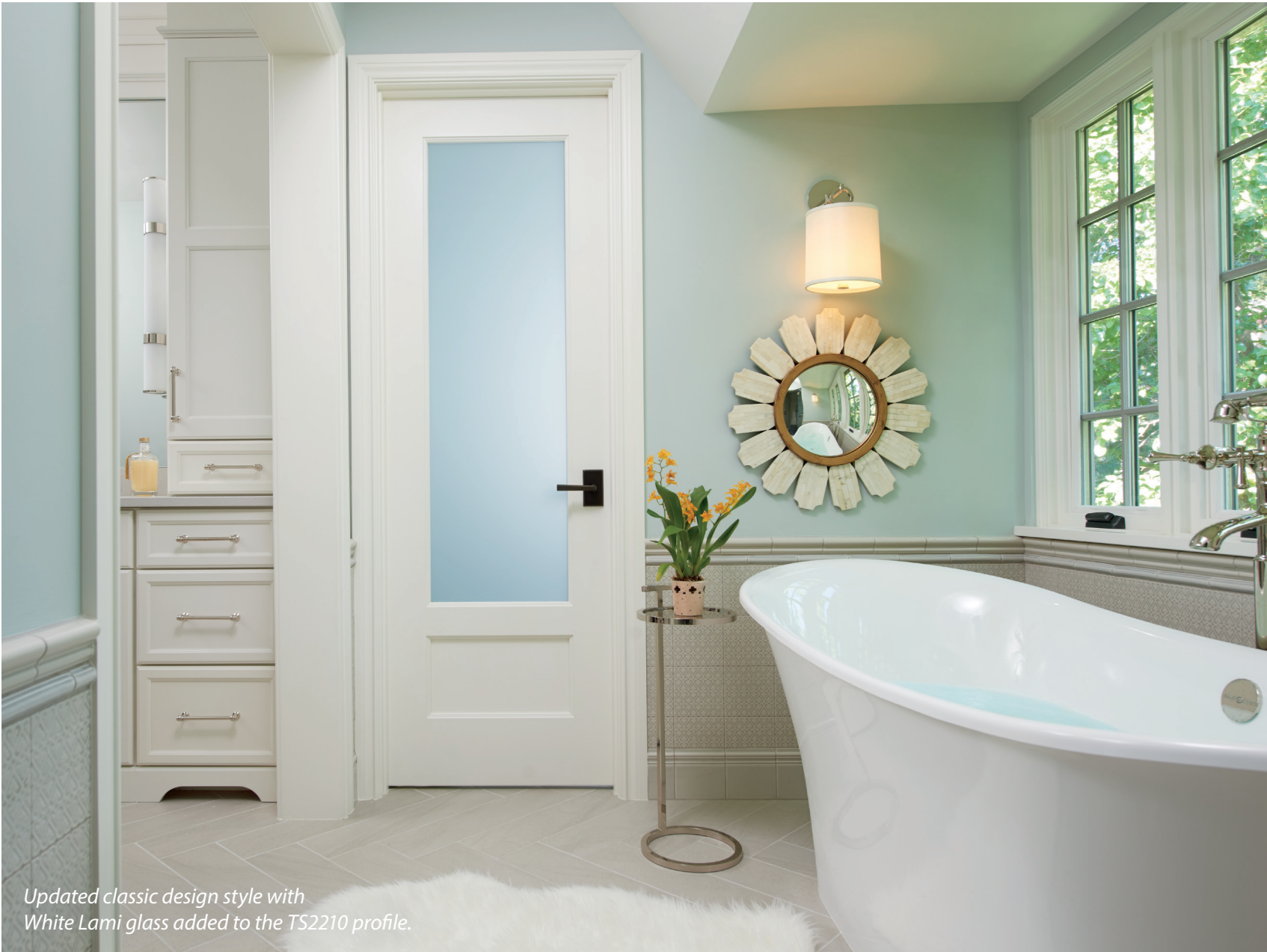
Updated classic design style with White Lami glass added to the TS2210 profile.