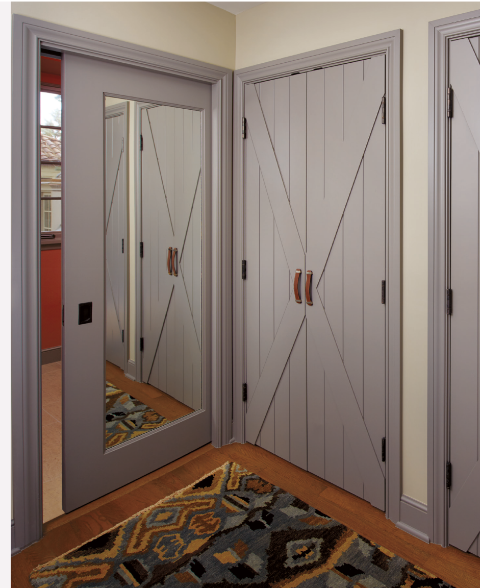
The mirrored pocket door adds space and functionality while the custom cross buck moulding on the VG1000 creates a distinctive design feature.

Fully customize your look with applied moulding, split styles and panel substitutions such as the mirror added to this pocket door in the boys' room (shown right).