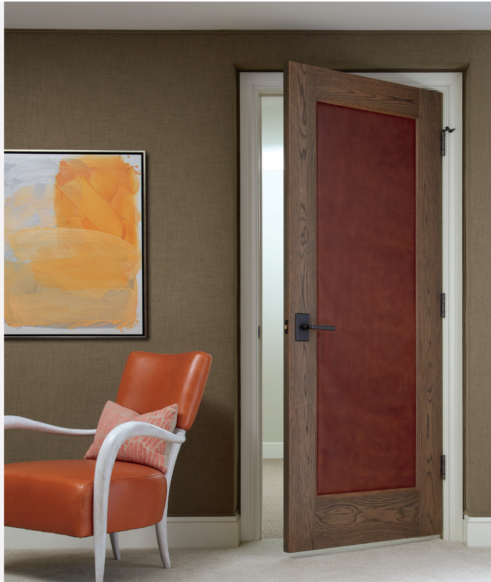
Every opening is an opportunity to make a statement. Edelman's Pampas leather creates a rich accent in this room.