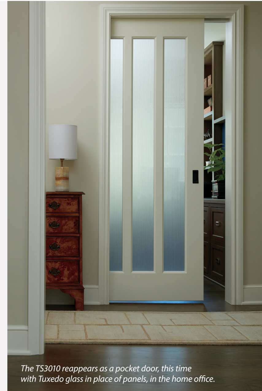
The TS3010 reappears as a pocket door, this time with Tuxedo glass in place of panels, in the home office.