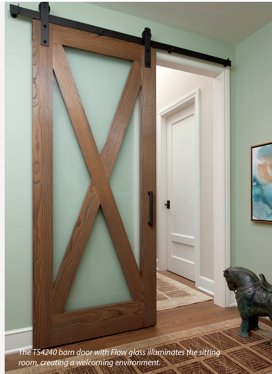
The TS4240 barn door with Flow glass illuminates the sitting room, creating a welcoming environment.

No matter if it's a distinctive wood species or a paint-grade MDF door, the design can be carried across them all — keeping the rhythm of the design flowing from room to room.